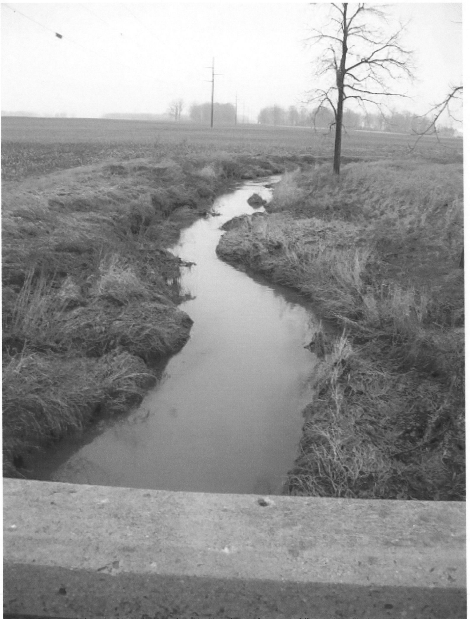
Photo looking North from bridge on 256th Street